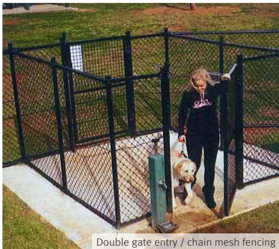
Double gate entry / chain mesh fencing