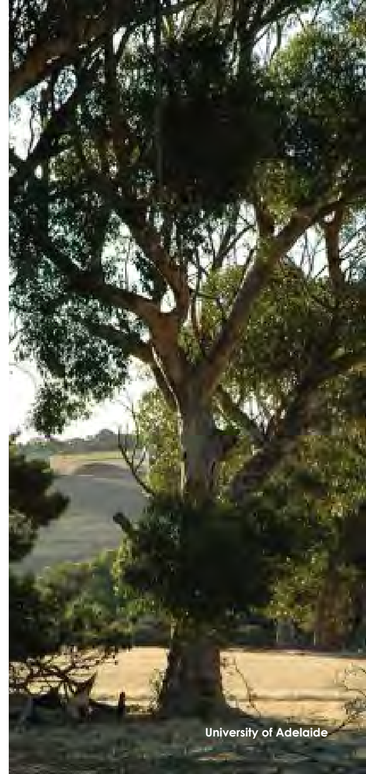
University of Adelaide

Today, with increasing government and community recognition of the potential impacts of climate change, the University of Adelaide has identified an opportunity to establish the Woodland Recovery Initiative at Glenthorne. The Friends of Glenthorne support this initiative.