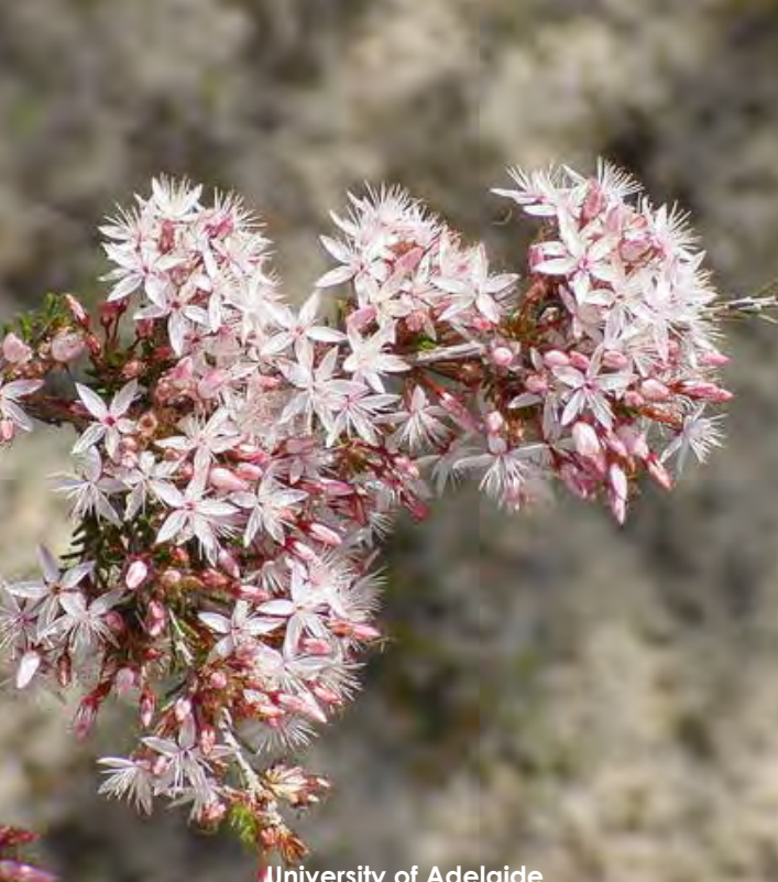
University of Adelaide