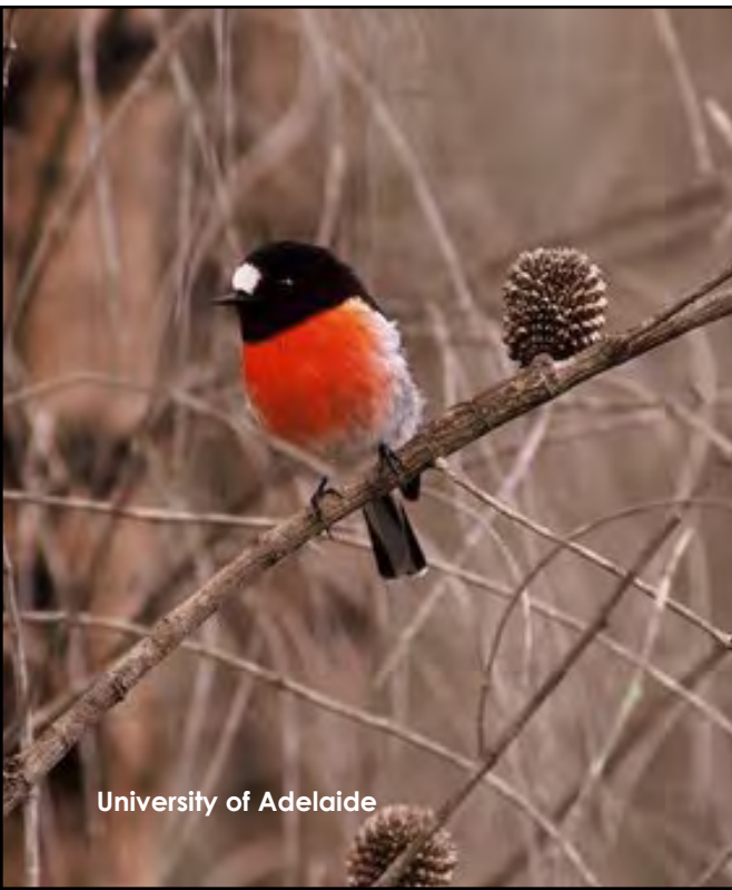
University of Adelaide

The very close proximity and accessibility of the farm to urban areas provides the opportunity for the precinct to become an open space that is well used by disabled people and their families and carers. It has the potential to become a leader in access to nature and open space for people with a disability.