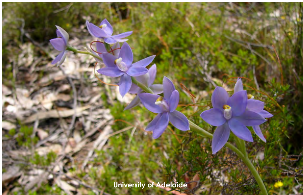
University of Adelaide