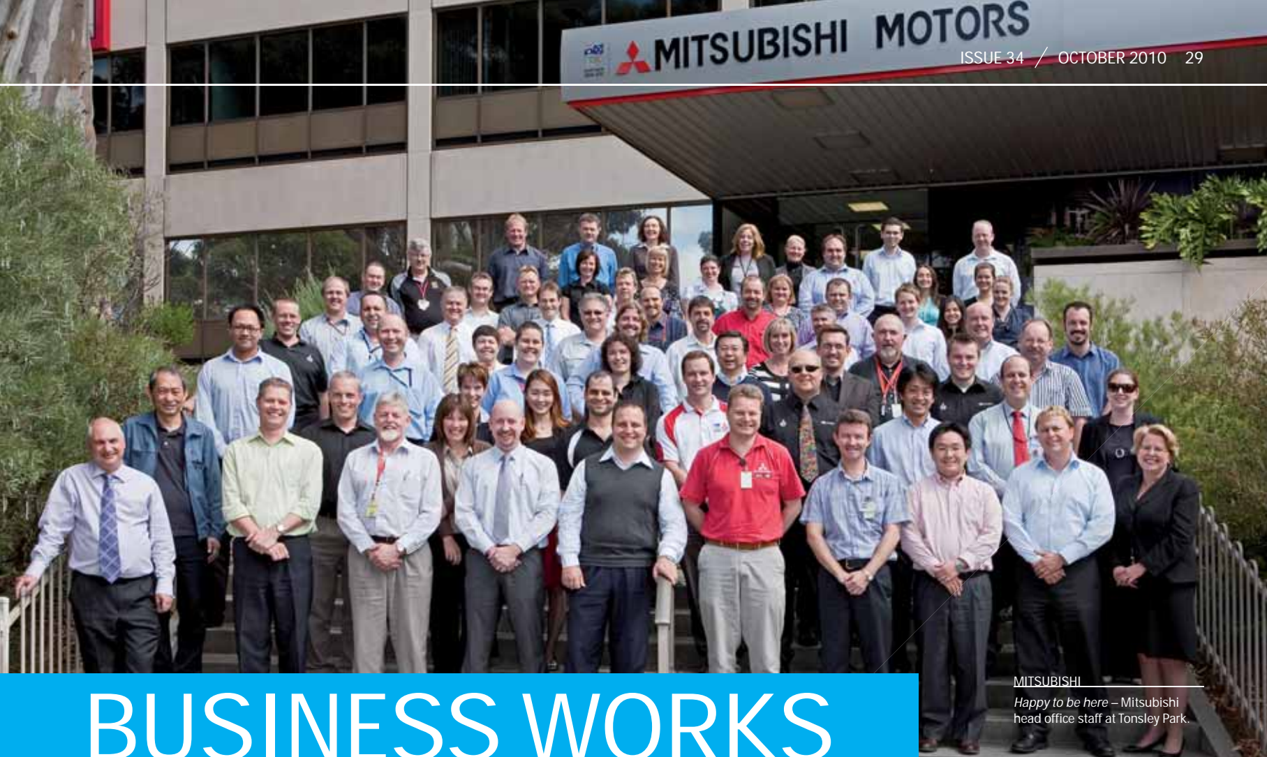
MITSUBISHI Happy to be here – Mitsubishi head office staff at Tonsley Park.