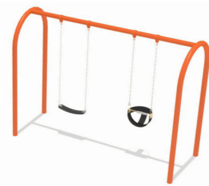
Swing with toddler seat