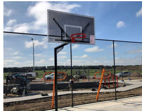
3 on 3 basketball (with noise reducing backboard)