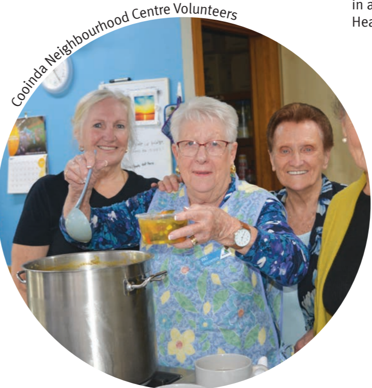
Cooinda Neighbourhood Centre Volunteers

Note: Payment of medical expenses in this section is in alignment with the requirements under the Private Health Insurance Act 2007.