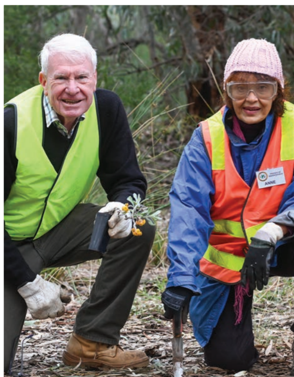
Friends of the Upper Field River Volunteers