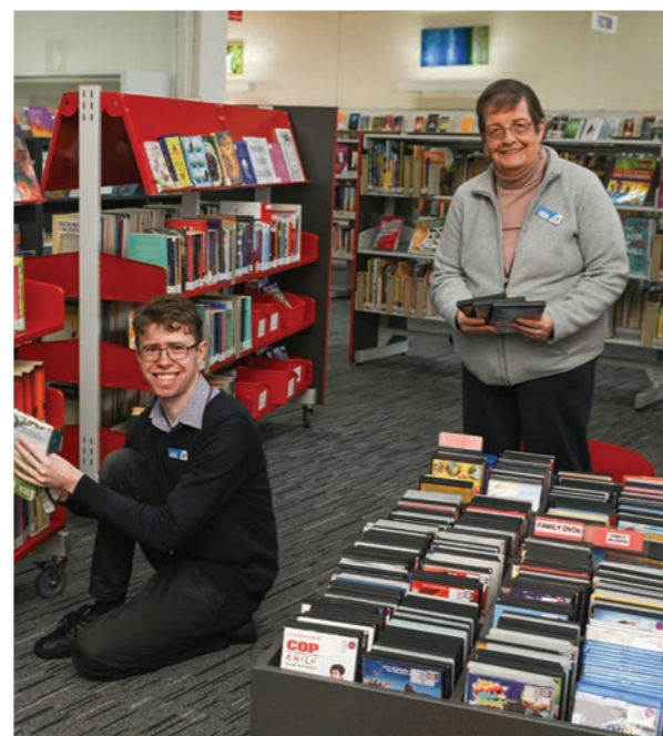
Parkholme Library Volunteers