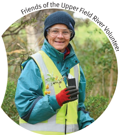
Friends of the Upper Field River Volunteer