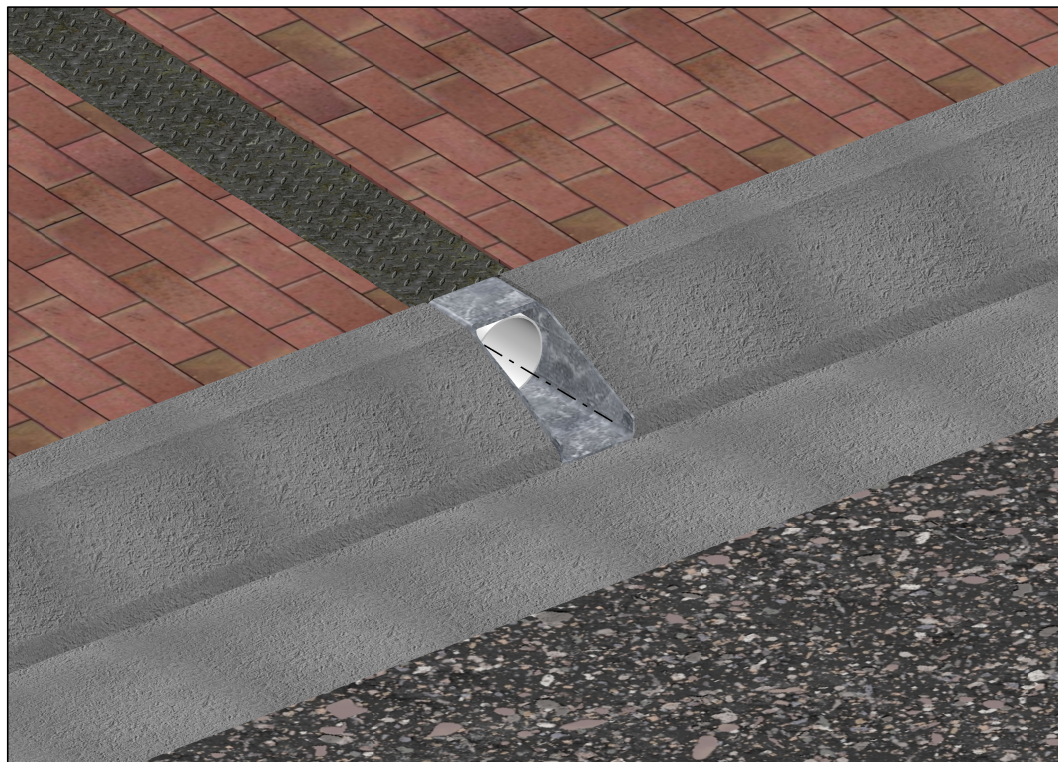
KERB INSERT ADJACENT TO PAVED FOOTPATH UTILISING A TOP HAT